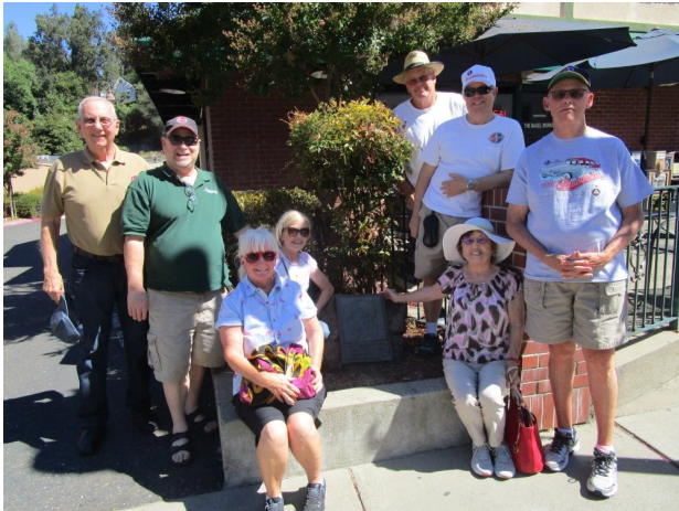
Our group at the John M. Studebaker Marker