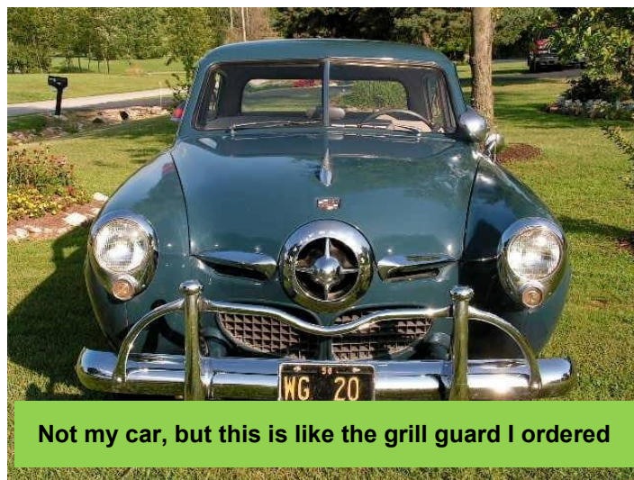
Not my car, but this is like the grill guard I ordered

Driving such an iconic car draws a lot of positive attention. Sometimes people come up to me with questions, other times it's stories. One time I pulled up to a burger stand and a kid in the next car over blurted out "look at that bootsy old car". I still have to bite my tongue when I think of how I should have responded ha-ha. But there is nothing that can take away the feeling of knowing that you've made it. The feeling of being a young Studebaker hobbyist who has found his place as a vendor, while driving around in a cool old bullet nose with these lyrics playing in the background "Nothing can stop me now...cause I'm.. the Duke Of ...Earl.... so hey yea yea yeah"