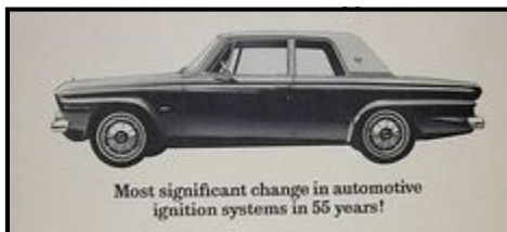
Most significant change in automotive ignition systems in 55 years!