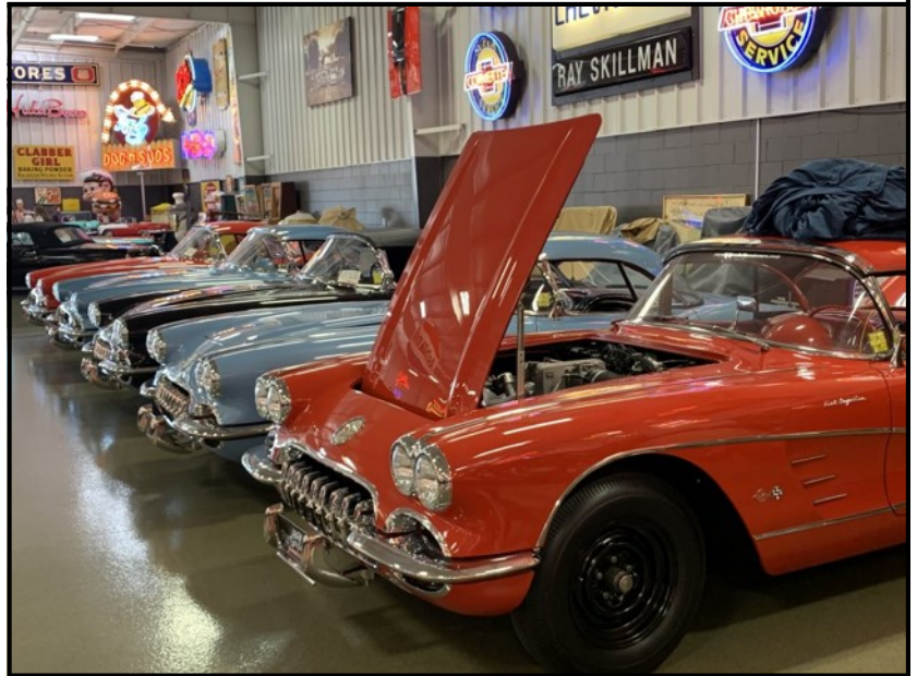
A few of the Corvettes in the museum. Every Corvette in this photo had stock factory fuel injection. Every car in the museum had the key in the ignition and was ready to drive

Now for the rest of the story. The daughter and son-in-law are in the process of restoring a Studebaker dump truck. Yes, they actually saw this long-abandoned dump truck in a field and finally talked to the owner and bought it. The Studebaker dump truck also has been completely dismantled, pieces restored/repaired/replaced, and is in the re-assembly process. They want to drive it from Colorado to the 2022 International Meet next year in South Bend.