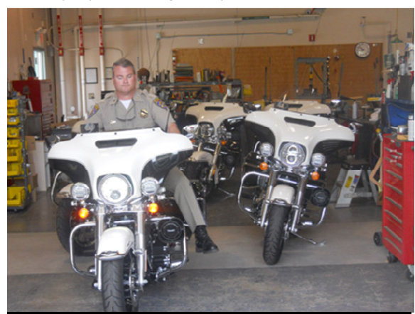
"Harley-Davidson to the rescue "Harleys are now the proud motorcycles of choice for the CHP

The CHP Academy is unique in that it requires all cadets to live at the academy throughout the 27 week training course. Currently, the attrition rate (% of cadets who don't make it through to graduation) is ~35%, and over 50% in the motorcycle training group. This is a "military style" training facility.