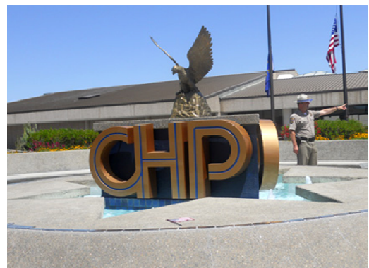
"The CHP Fountain" Each of the 225 deceased CHP officers is honored with a bronze plaque on the outer edge of the fountain.

One of the events offered at this year's Zone Meet was a tour of the California Highway Patrol Academy. Fourteen of our bravest passed through the security gate of the CHP Academy at 10am for a 4-hour adventure amongst the 457 acre site in West Sacramento.