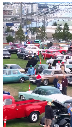
Partial view of show field