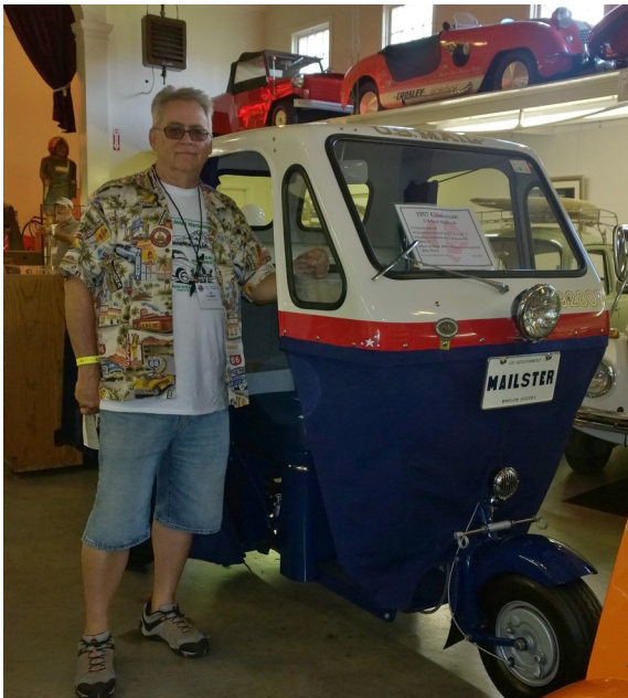
How about a Cushman Mail Truck?