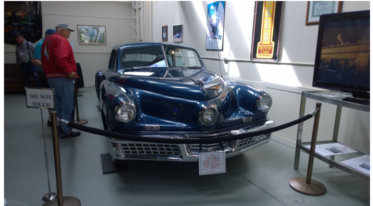
At the LeMay family collection; What could be better than a Tucker