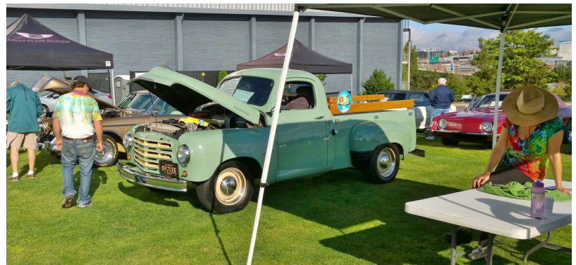
Judgement Day... He's got a fine tooth comb in his pocket