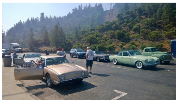
Meeting—in Smoky Places (Shasta)