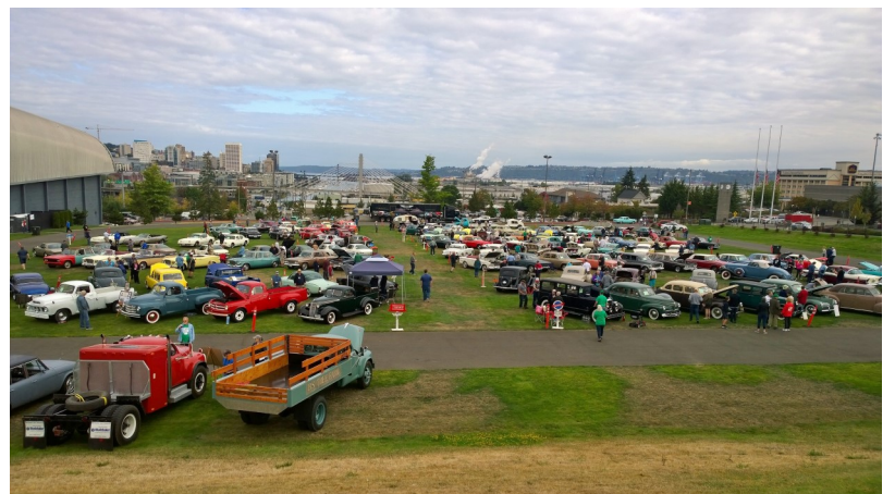
The Display Field at The LeMay Museum. Lots of Studes