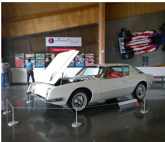
The beautifully restored #1 production Avanti