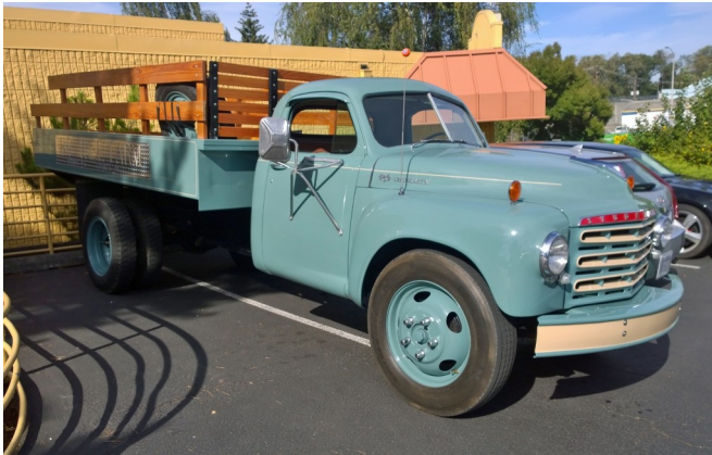
Who said "I didn't know Studebaker made trucks"